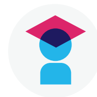
Proven Practices Academies